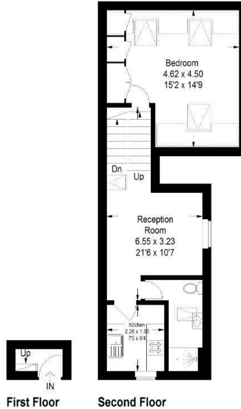
First Floor Second Floor

These plans are for representation purposes only as defined by RICS - Code of Measuring Practice. Not drawn to Scale. Windows and door openings are approximate. Please check all dimensions, shapes and compass bearings before making any decisions reliant upon them.